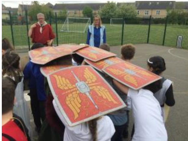
8 - Learning how Roman soldiers protected themselves during battle.