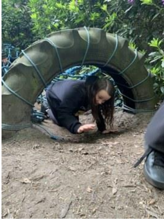
10 - Hilltop Assault Course