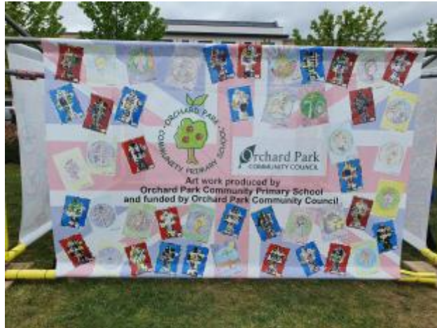
2 - Art Display on Unwin Square