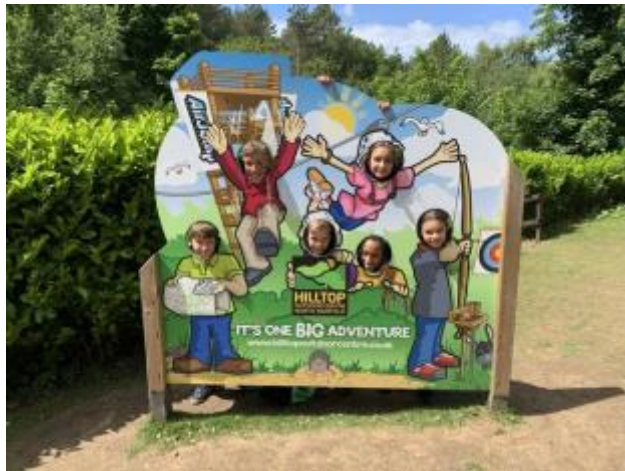
13 - Memories that will last forever!