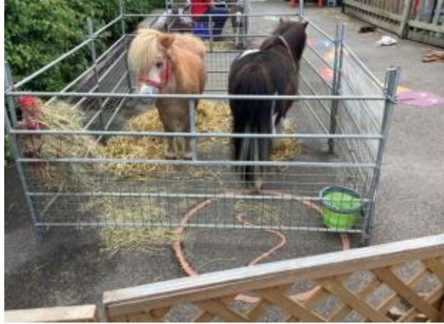
6 - Another brilliant visit to nursery Monarch Farm.