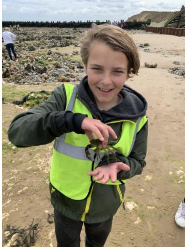
12 - Exploring rock pool life.