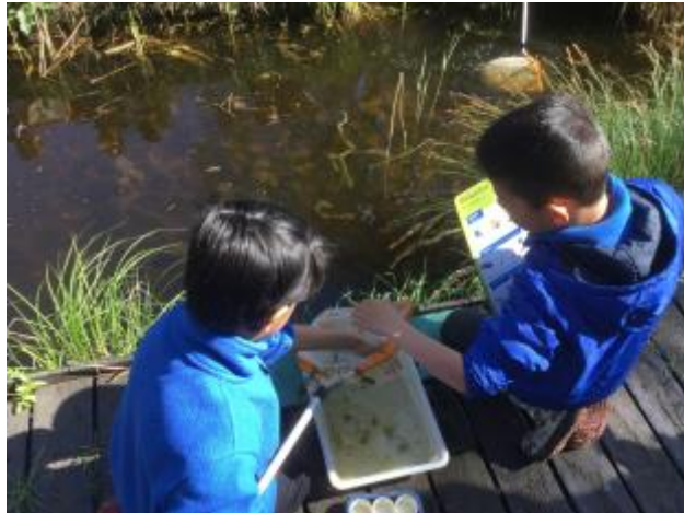
5 - Discovering wildlife at Wicken Fen