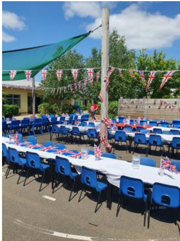
1 - Picnic on the playground

Yesterday, the school's artwork was put on display on Unwin Square. Thank you to all the pupils and their families who managed to join us for the unveiling. If you have not had chance to have a look, then please find some time over half term to view our work. It will be on display for approximately three weeks.