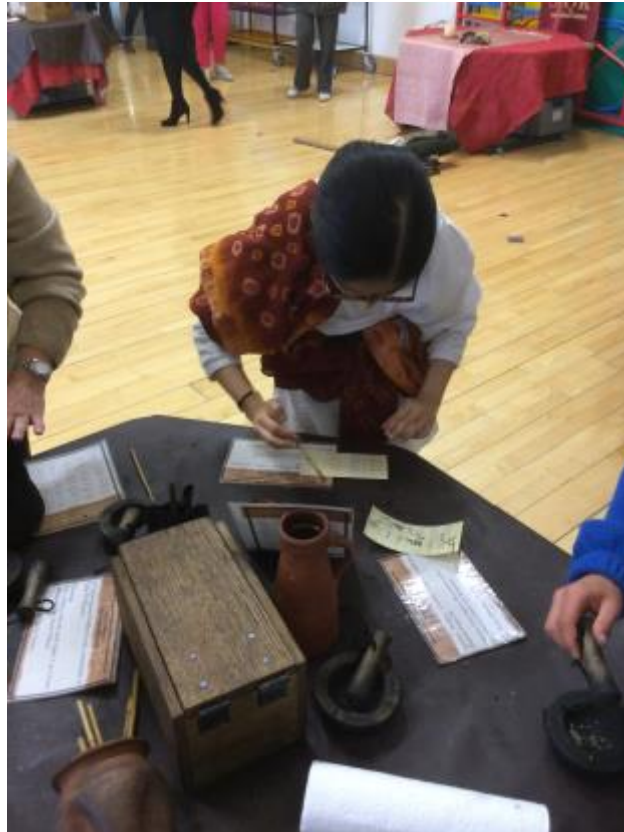
9 - History of the page workshop