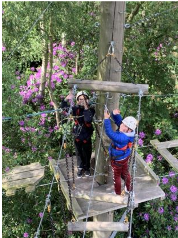
11 - Tree Top Challenge