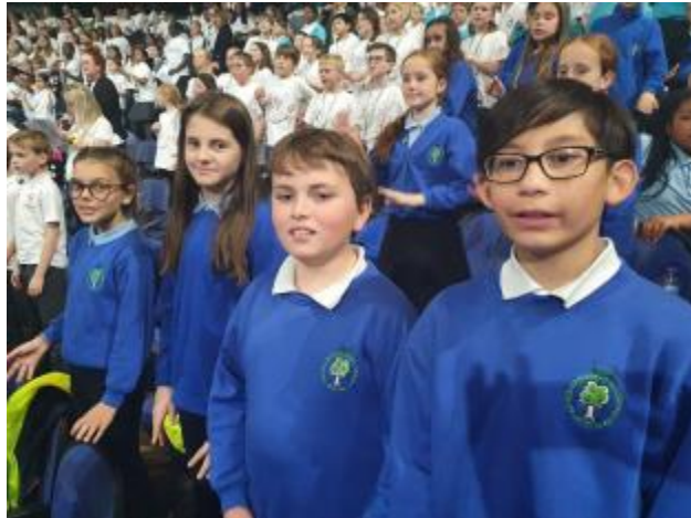
7 - Young Voices